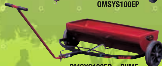
OMSYS100EP + PUME