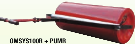
OMSYS100R + PUMR